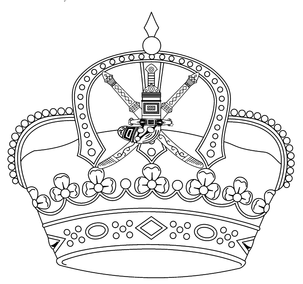
FIGURE 2. One of two provisional designs for the royal emblem presented to Sultan Qaboos. This was the one chosen.